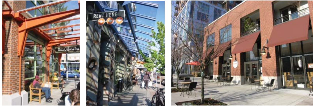
precedents for street level character and scale