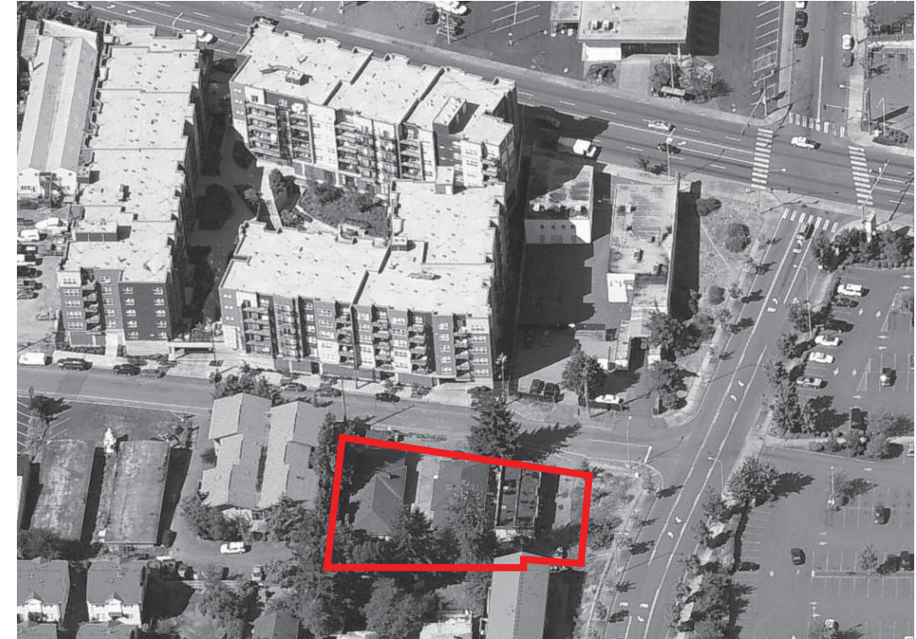
aerial view of site