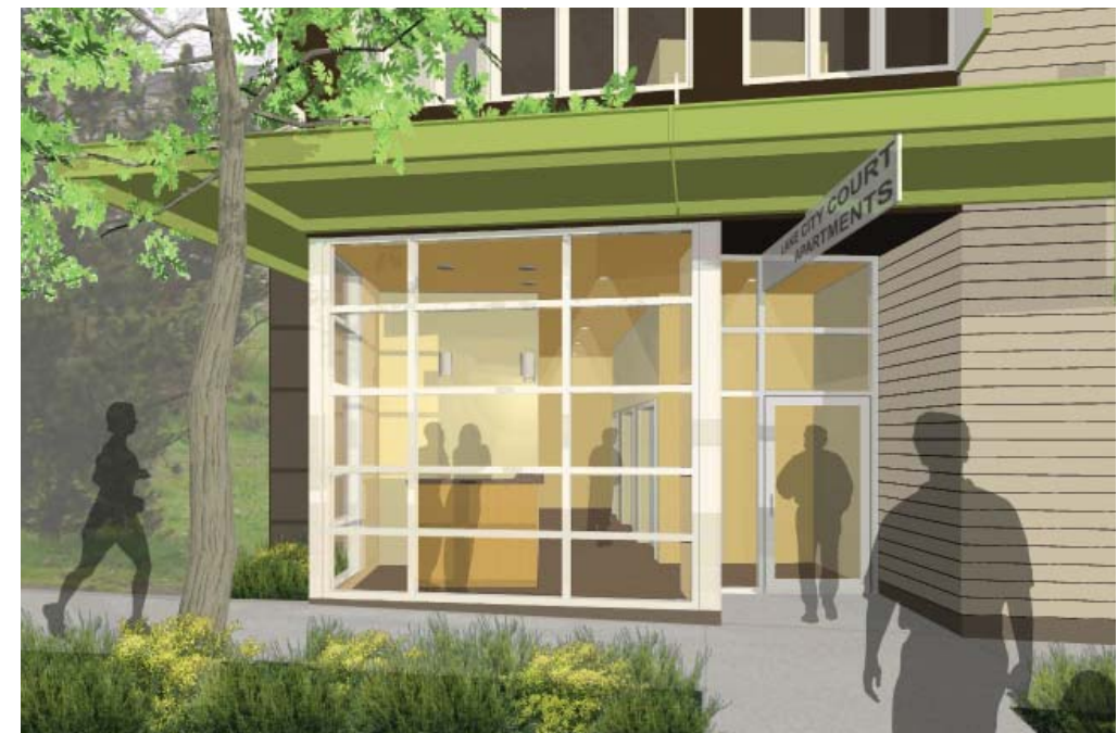
residential lobby perspective